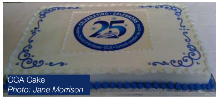
CCA Cake