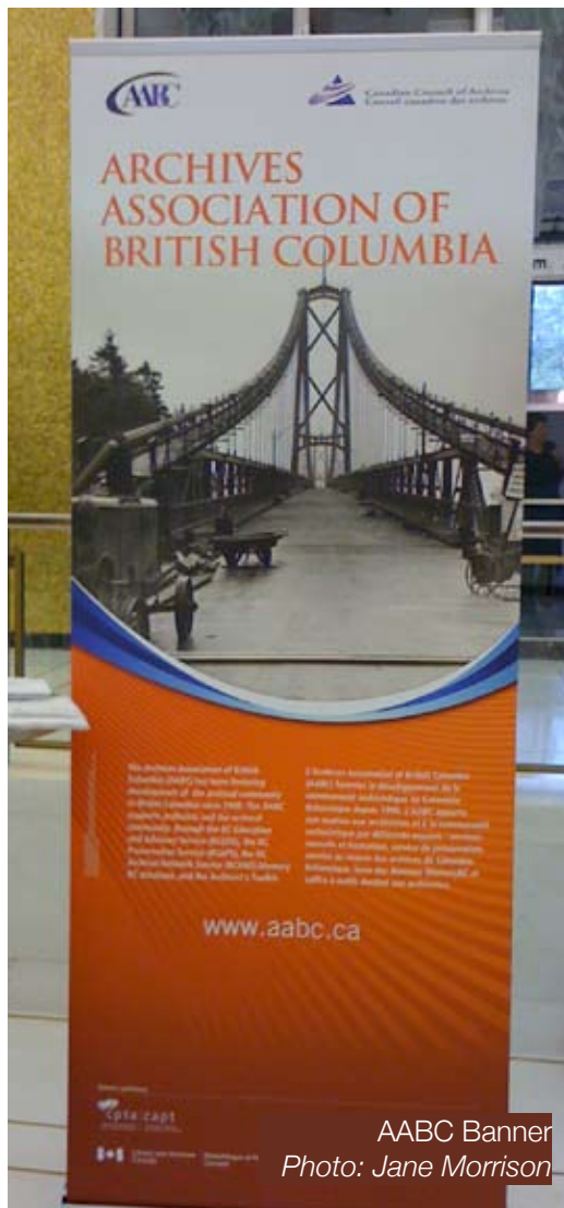
AABC Banner

Congratulations and many thanks to the CCA, and keep an eye out for the banner at future AABC events! ❖