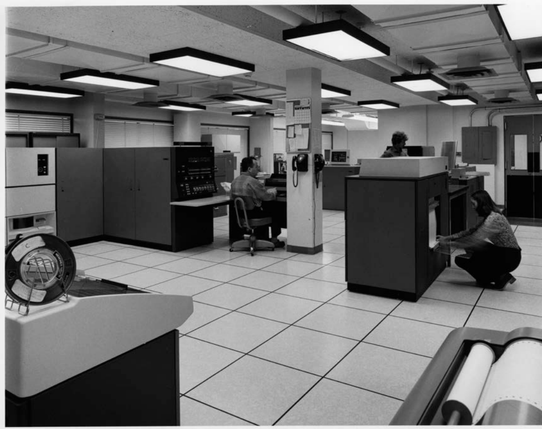
UVic Computer Centre, February 1974.