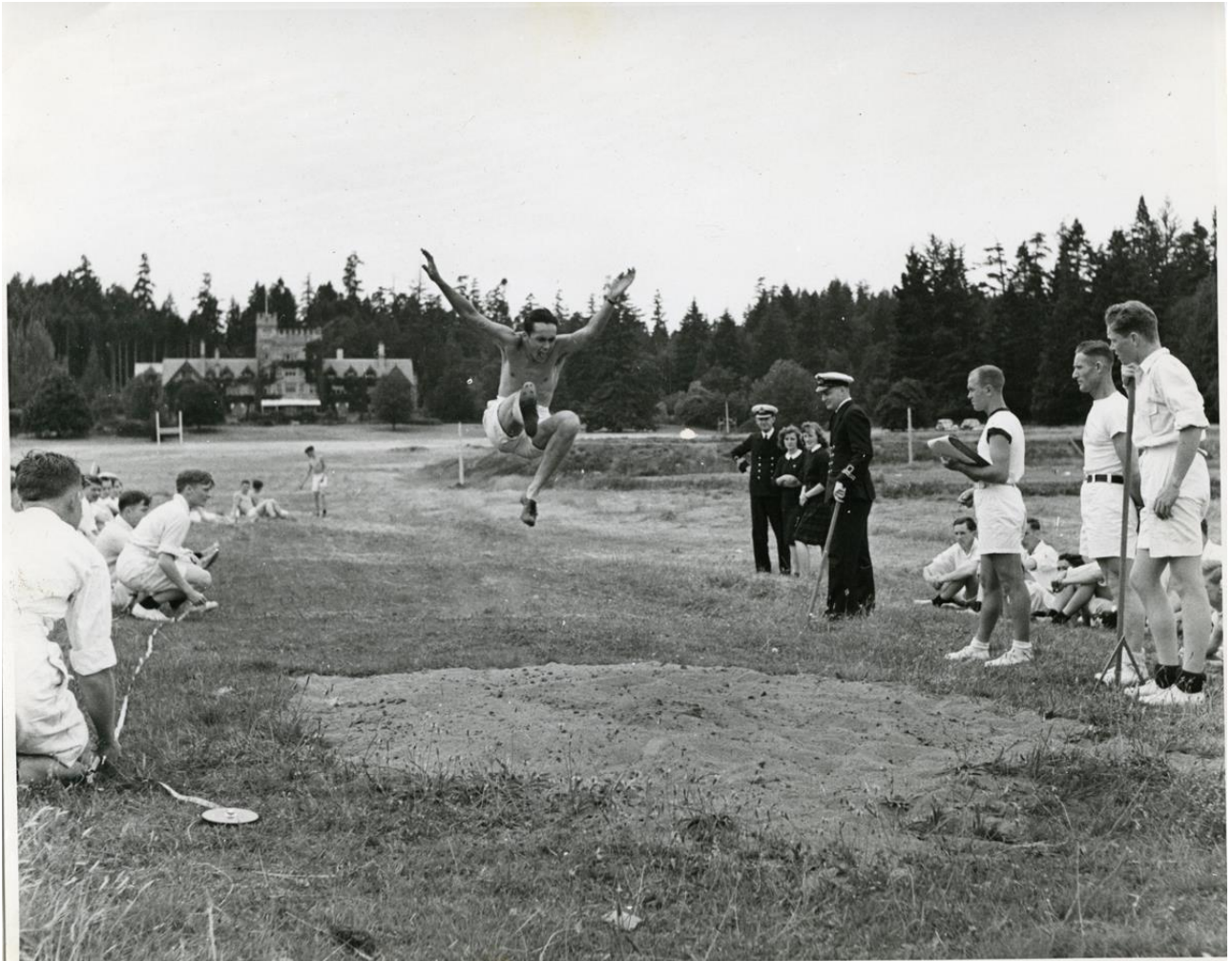
Long Jump at Royal Roads Naval College, ca. 1942

Thursday April 29, 2021 – 5:30pm via Zoom Conference